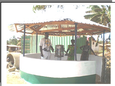
Top - finishes well Right- worker going down in well