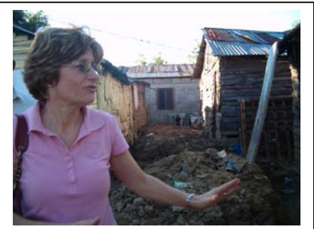
Mud left at the houses from the river. Mud still in some of the houses The Reiles Area They have cleared paths to get around