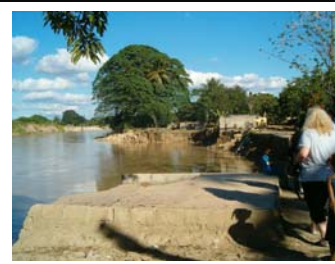
Where the church used to be at the Rieles area