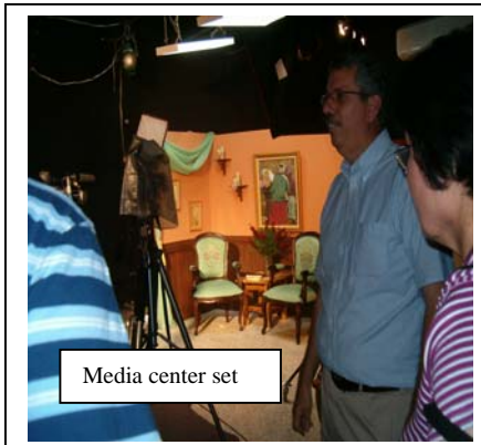
Media center set