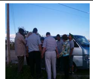
Team praying in Ranchito Area at land for new church & school